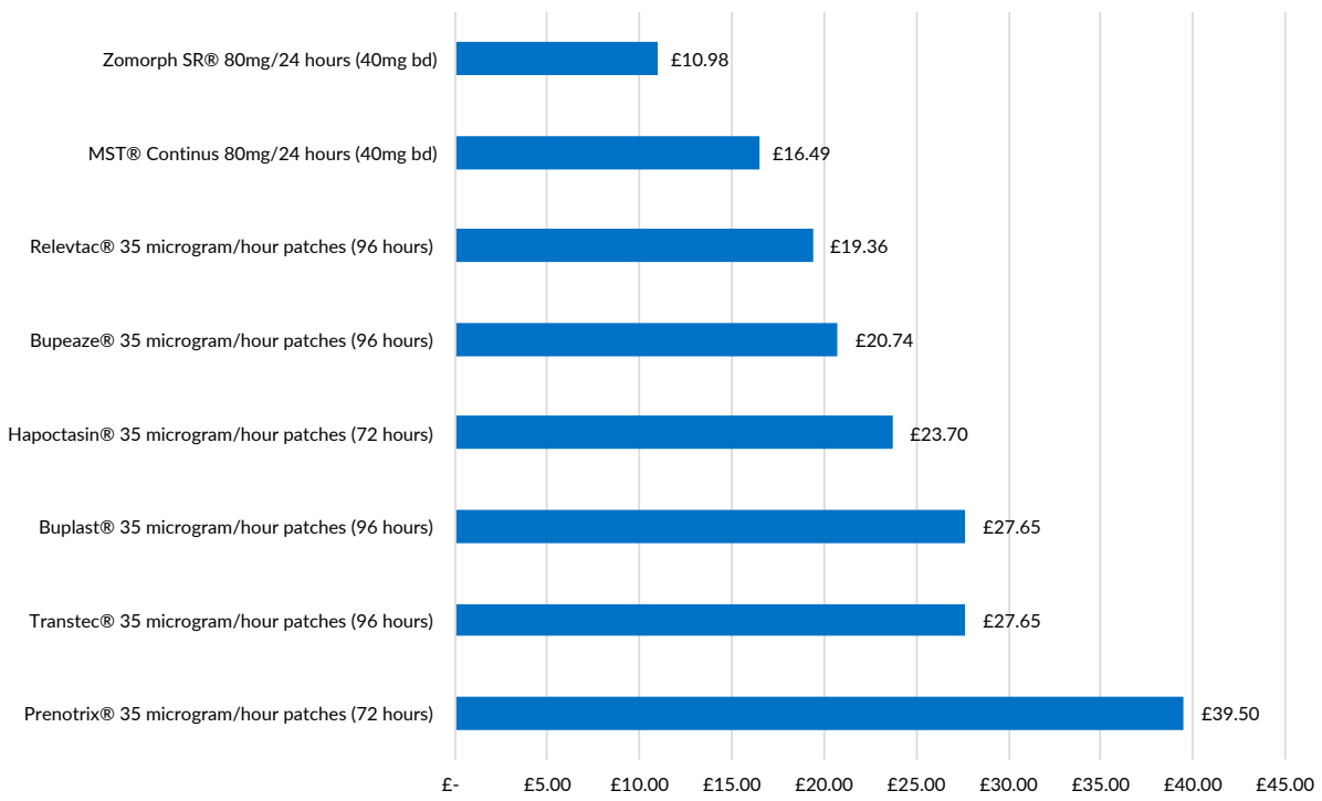
Chart 3: Comparison of 28 day cost<sup>9</sup> of 35mcg/hr buprenorphine patches to 60mg daily SR oral morphine<sup>8</sup>

Note: Generic morphine sulphate SR capsules prices are the same as Zomorph® SR capsules.